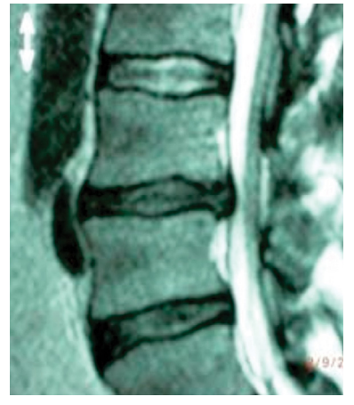
Pre-treatment T2 weighted saggital