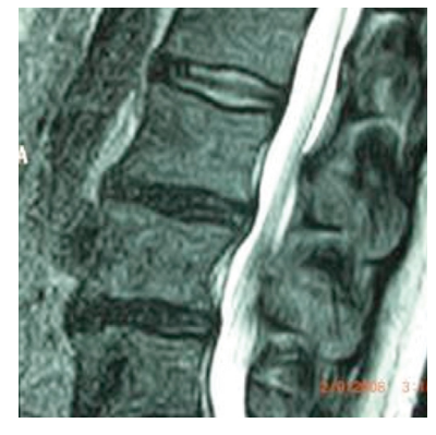
Post treatment T2 weighted saggital